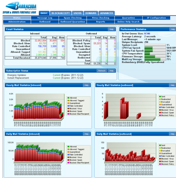
The Barracuda Spam & Virus Firewall filters all email messages and displays the number of emails received with statistics on how they were processed.

The Barracuda Spam & Virus Firewall is easy to set up with no software to install or network modifications required – minimizing ongoing administration. Energize Updates are delivered automatically by Barracuda Central, an advanced technology center where engineers work relentlessly to provide the latest spam definitions, virus definitions, and security updates which are distributed hourly for continuous protection against the latest threats.