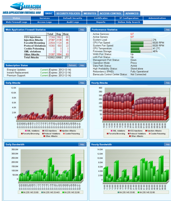
The Barracuda Web Application Firewall monitors and tracks common application attacks, performance statistics and bandwidth usage.

To minimize ongoing administration associated with protecting Web sites against application vulnerabilities, the Barracuda Web Application Firewall automatically receives Energize Updates with the latest policy, security and attack definitions. In addition to the comprehensive security benefits, there are also application delivery capabilities such as SSL offloading, SSL acceleration and load balancing. These capabilities are designed to improve the performance, scalability, and manageability of today's most demanding data center infrastructures.