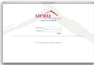
1. Authenticate using Web authentication