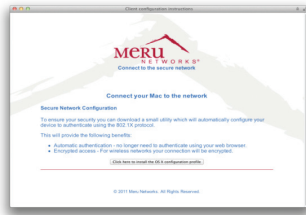
2. One-click to configure 802.1x